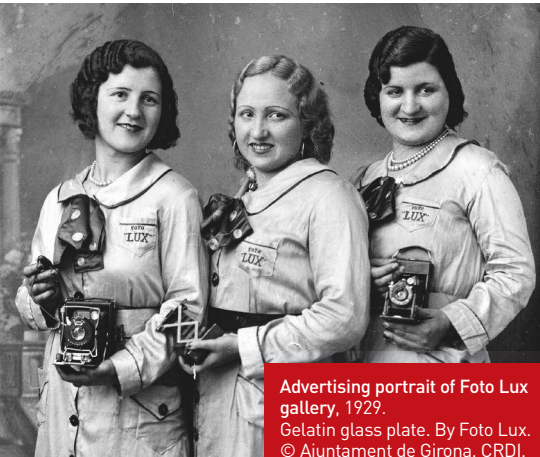
Advertising portrait of Foto Lux gallery, 1929. Gelatin glass plate. By Foto Lux. © Ajuntament de Girona. CRDI.

All photographic processes that forever changed our understanding of time will be documented: from daguerreotype to collodion process to albumen and gelatin silver prints.