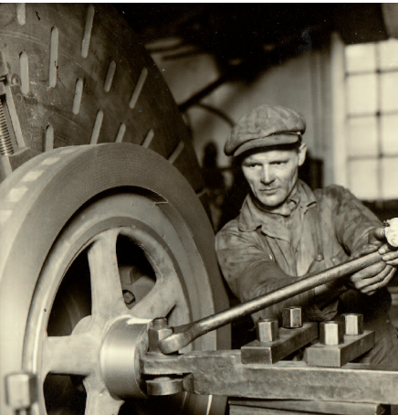
Fitter at the face lathe, Sabroe Machine Works, Århus, Denmark, 1934

Focus on places , people , events and trends that built modern Europe