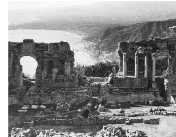
The Roman theatre at Taormina, Italy. 1890-1920.

This unique public-private partnership will demonstrate how both sectors can benefit from their participation in Europeana: private agencies can increase their business while photo archives and museums can market their collections to an even wider public.