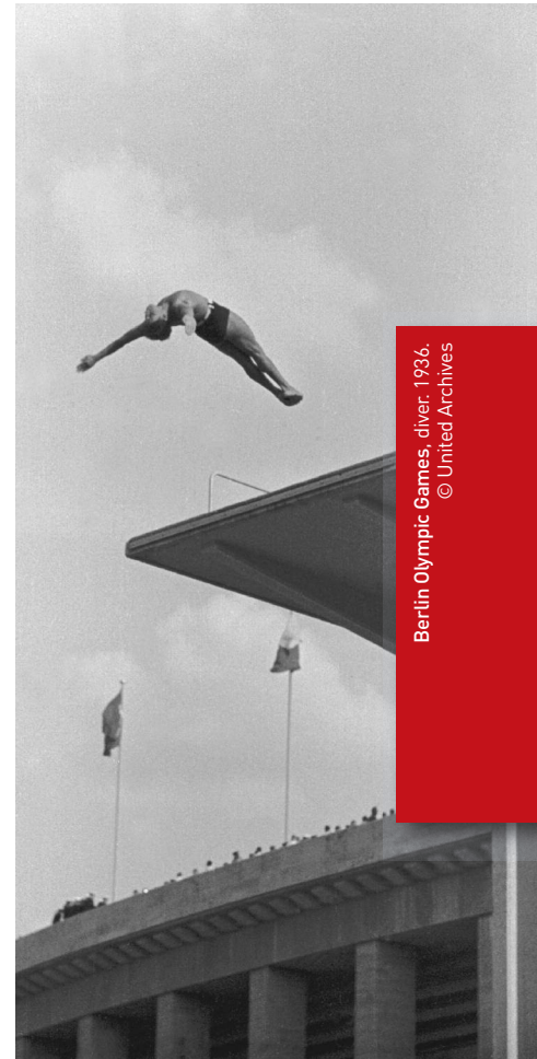
Berlin Olympic Games, diver, 1936.