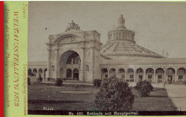
Vienna World Exhibition 1873. Rotunda with main entrance. 1873, by György Klösz. © IMAGNO/Austrian Archives

Architectural images, landscapes, cityscapes, paintings, sculptures, archaeological sites to illustrate history, art history and archaeology across Europe.