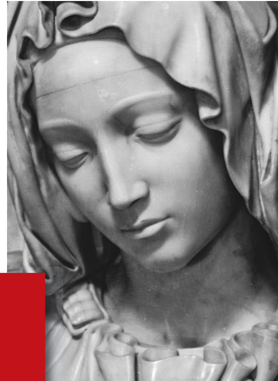
The Pietà, marble, Michelangelo Buonarroti, St. Peter's Basilica, Vatican City. 1500-1520

Multilingual functionalities for better search and retrieval in Europeana