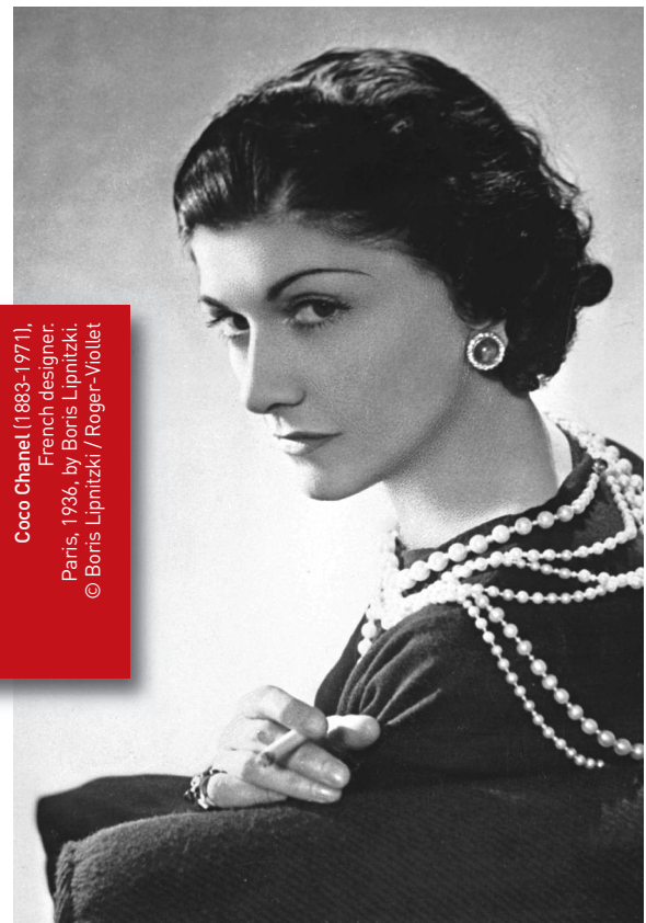
Coco Chanel (1883-1971), French designer. Paris, 1936, by Boris Lipnitski.

Over 430,000 photographs under digitization for Europeana