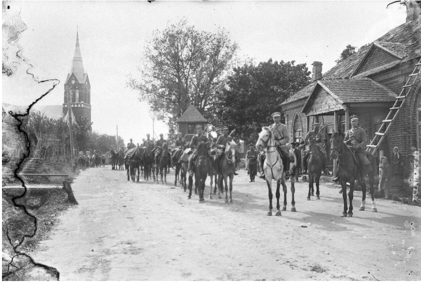
Mieziskiai village square. 1920s-1930s