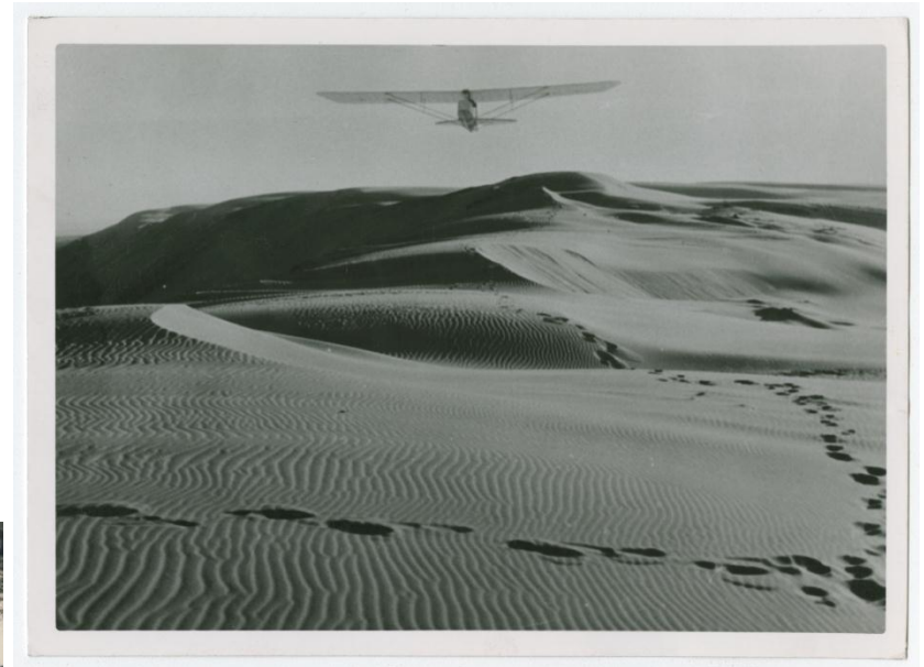
Julius Miežlaiškis. Curonian Spit. 1920s-1930s © M. K. Čiurlionis National Art Museum