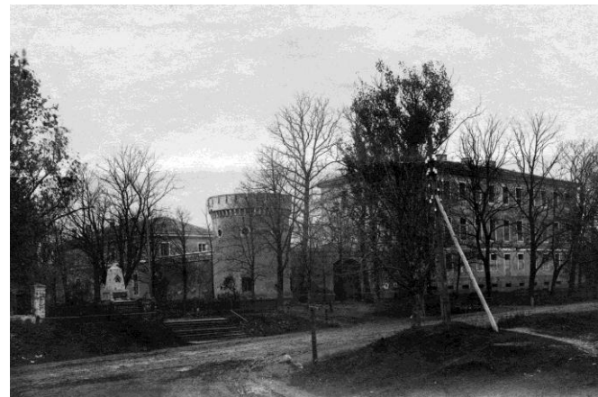
Building of customs. 1917