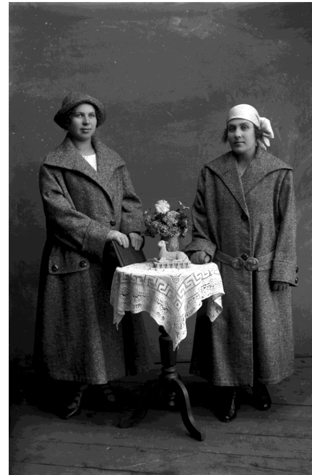
Ferinauskas. Two woman. 1920s-1930s