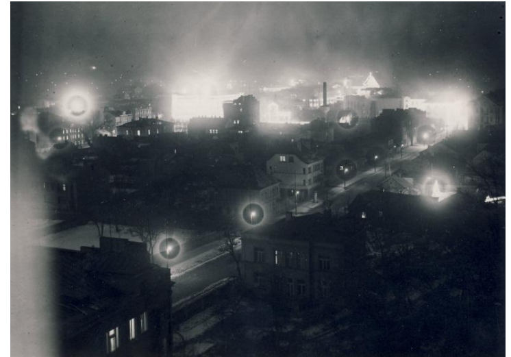
Kaunas at night. 1938