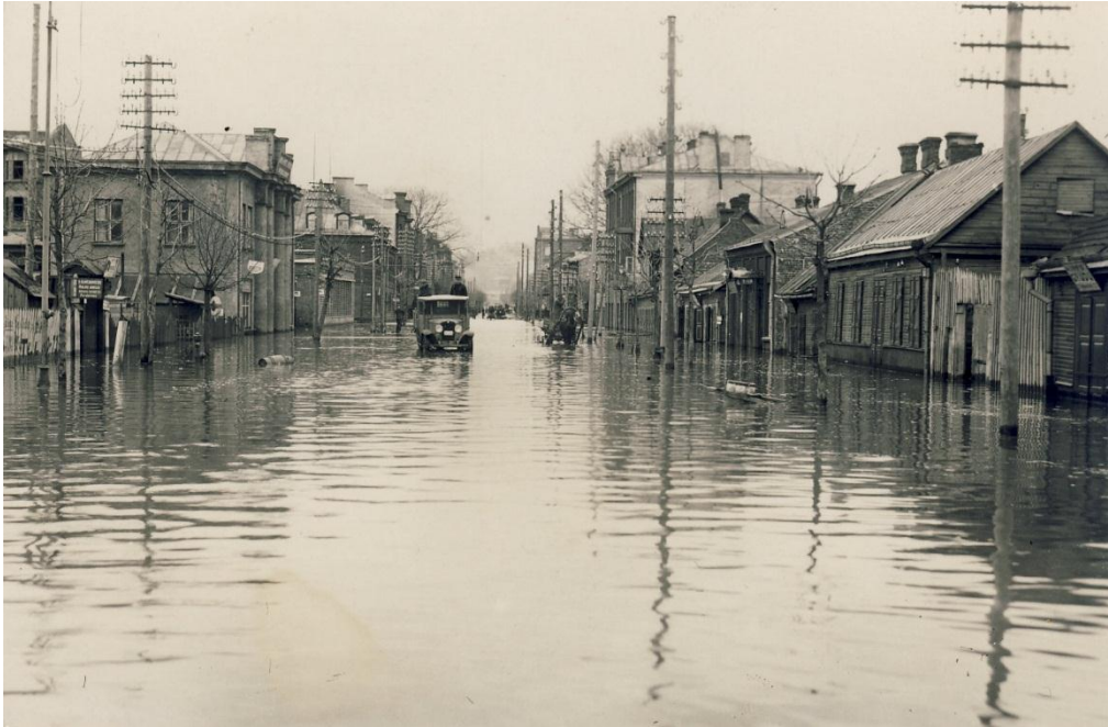
Flood in Kaunas. 1931