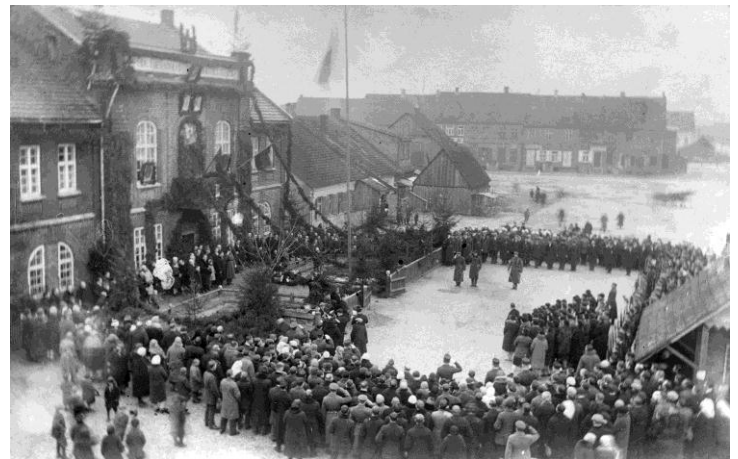
Celebration of the independence day on 16th February 1930