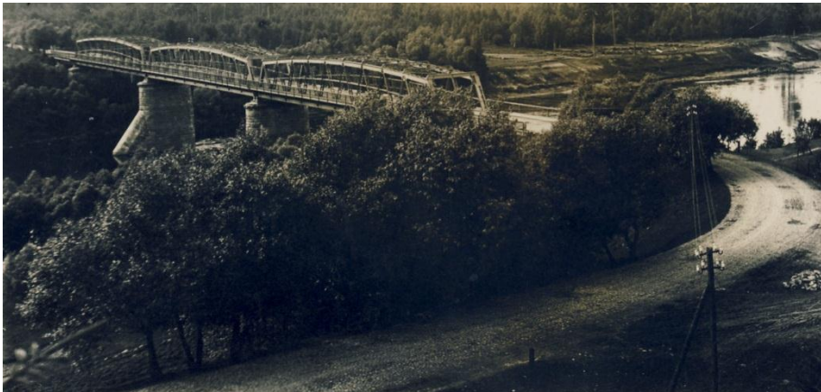
Alytus bridge. 1931