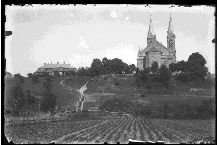
Bajorunas. Landscape with Krekenava church. 1920s-1930s