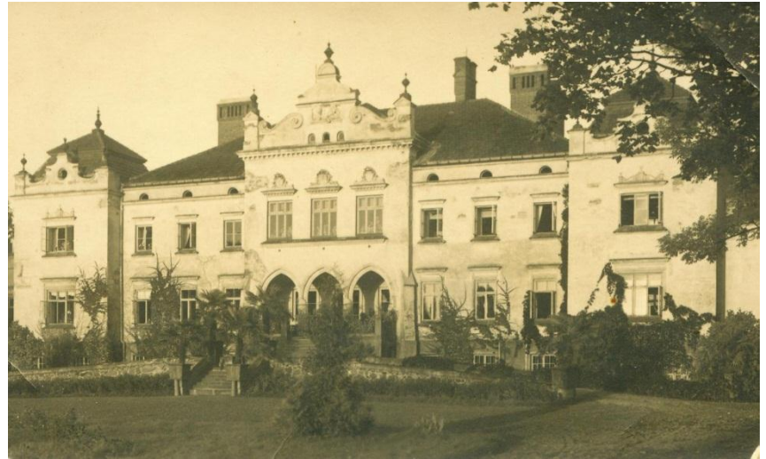
Rokiskis manor house. 1920s