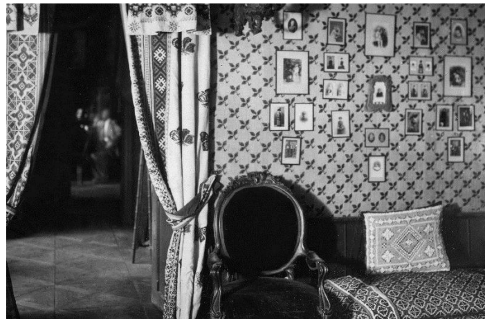
Jan Bulhak. Markuciai manor interior. Before 1935