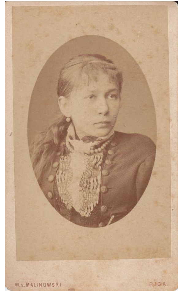
Writer Gabrielė Petkevičaitė-Bitė. Circa 1877.