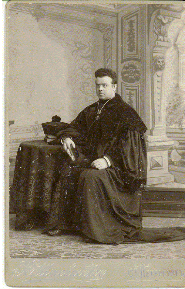
Poet Maironis. St. Peterburg. 1903

Maironis Lithuanian Literature Museum, about 1000 images