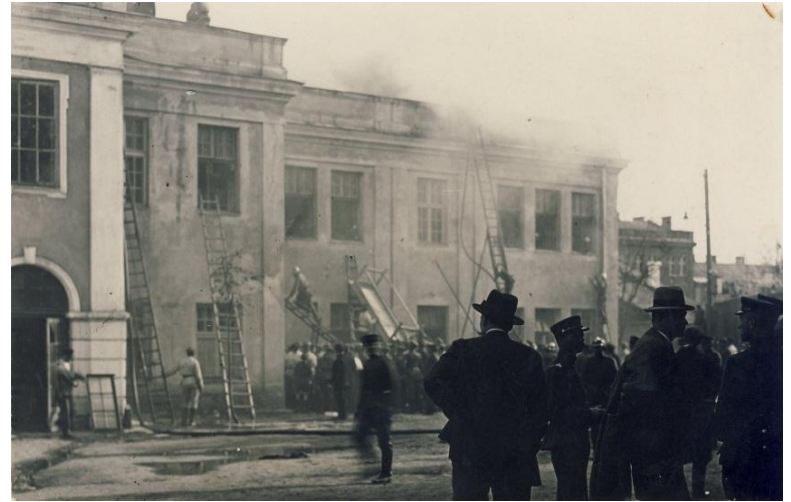
Fire in the Kaunas State Theatre. 1931